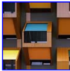
Apartments on the Coast – OFIS arhitekti