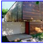
The Wolfe Den – MJ Neal Architects