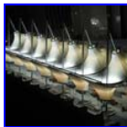
Rosa Parks Transit Center – FTL Design Engineering Studio