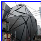
Jimbocho Theatre – Nikken Sekkei