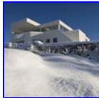
Villa G – Saunders Architecture