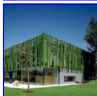
Kindergarten Sighartstein – kadawittfeldarchitektur