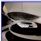
Chamber Music Hall for Manchester International Festival – Zaha Hadid Architects